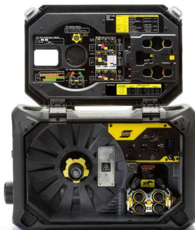
Internal LED lights and intergrated storage for wear parts in lid