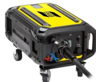
Wheel Kit and Strain Relief works with feeder horizontal or vertical